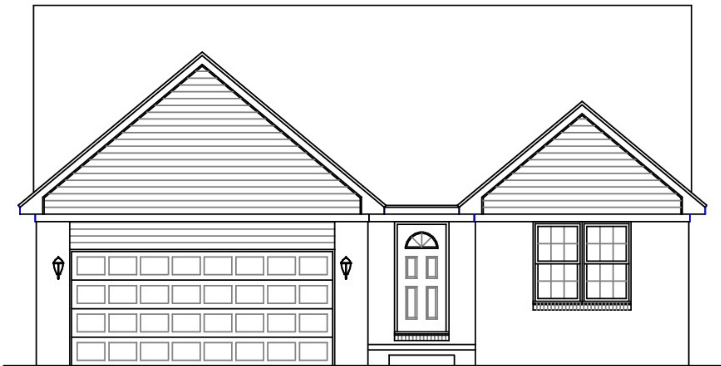
ELEVATION - A