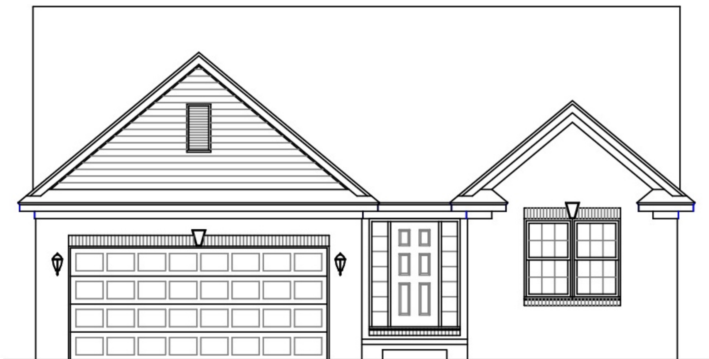
ELEVATION - B